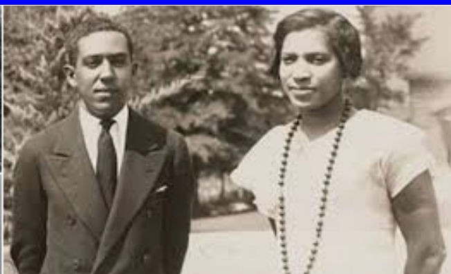
with Langston Hughes

Zora Neale Hurston (1891–1960): American author, anthropologist, and filmmaker. She portrayed racial inequities in the early-20th-century South and her struggles as an African-American woman. She was a central figure of the Harlem Renaissance. She wrote more than 50 short stories, plays, and essays. Hurston was awarded a Guggenheim Fellowship to conduct ethnographic research in Jamaica and Haiti.